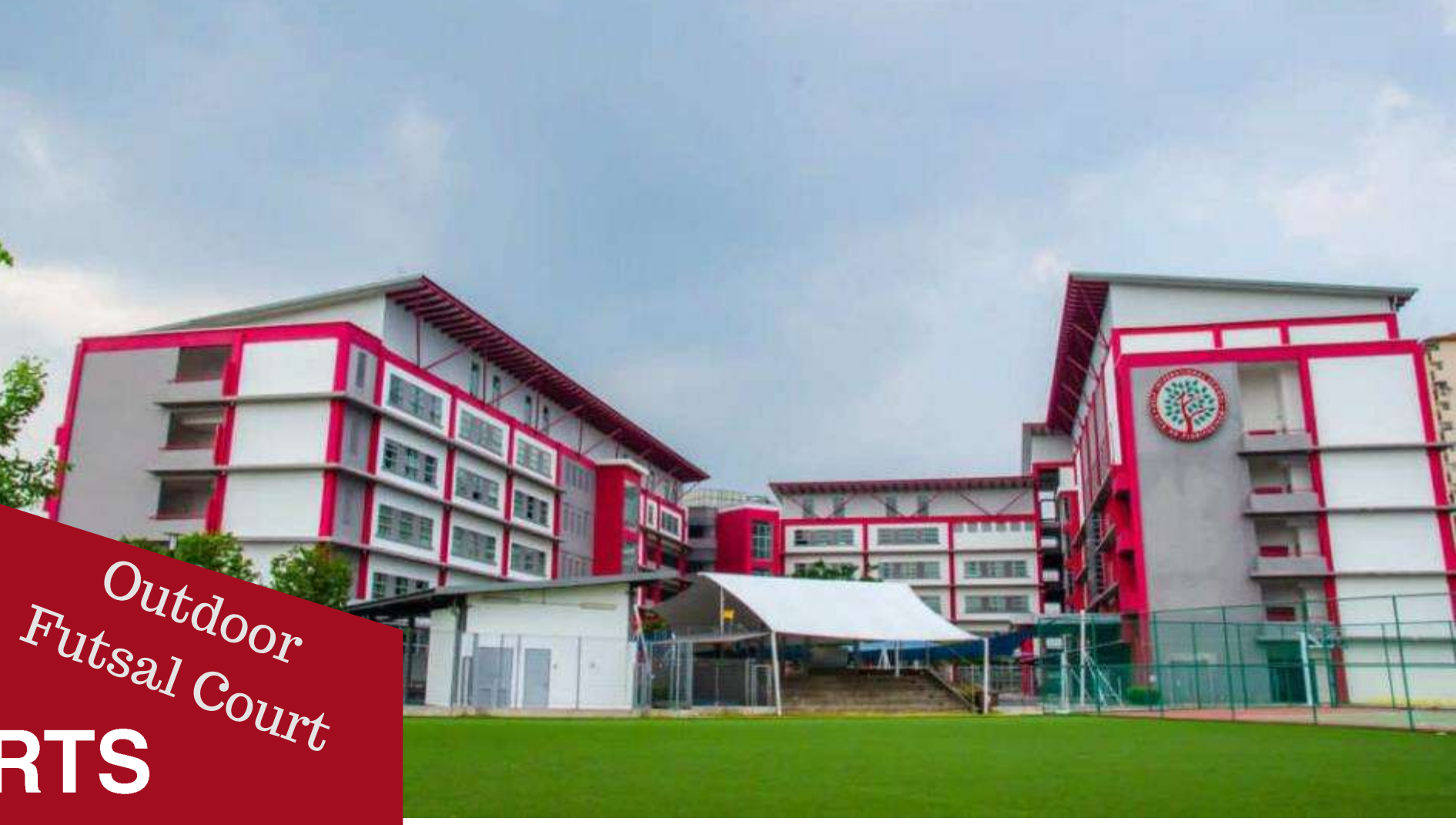
Outdoor Futsal Court