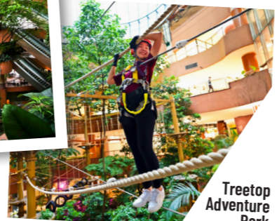
Treetop Adventure Park