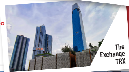
The Exchange TRX