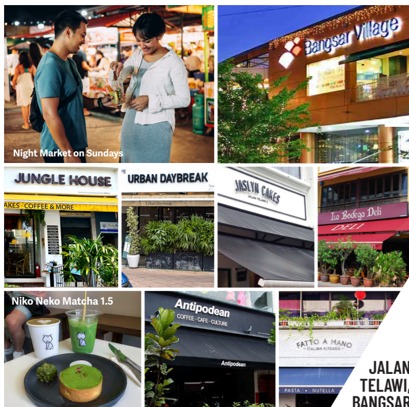
JALAN TELAWI, BANGSAR