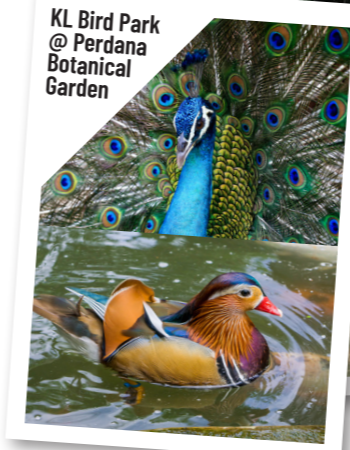
KL Bird Park @ Perdana Botanical Garden