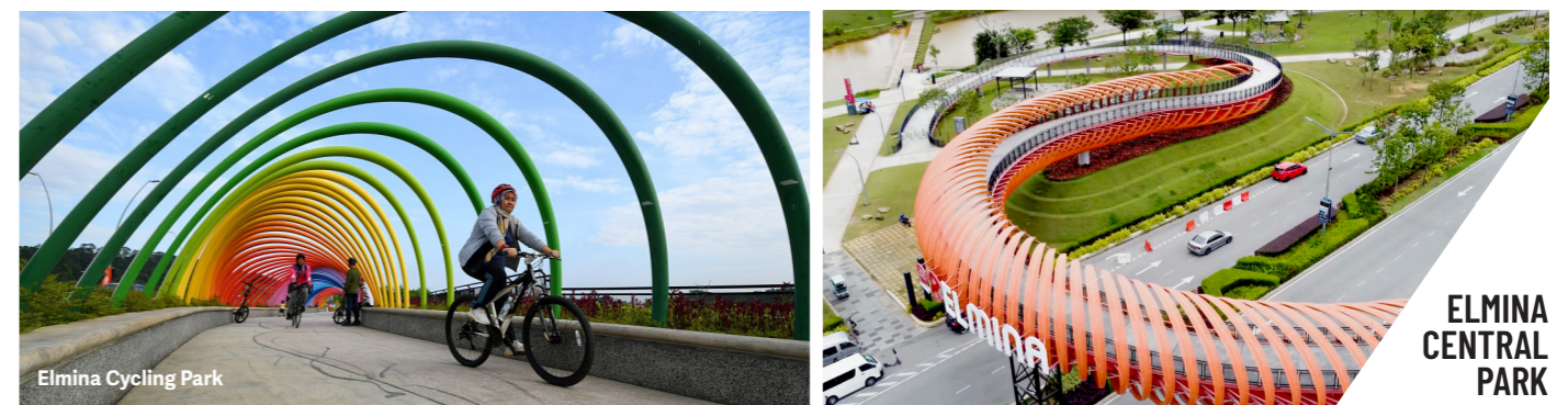
ELMINA CENTRAL PARK