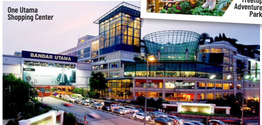
One Utama Shopping Center