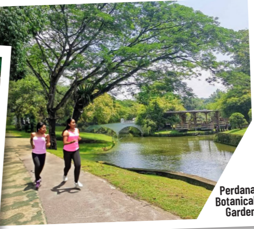
Perdana Botanical Garden