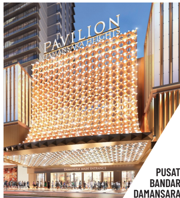
PUSAT BANDAR DAMANSARA

Why not dive into the electrifying energy of Damansara's city life? Surround yourself with a plethora of enticing dining spots, bustling restaurants, convenient banks, well-stocked grocery stores, top-notch healthcare facilities, and much more. Why not embrace the excitement?