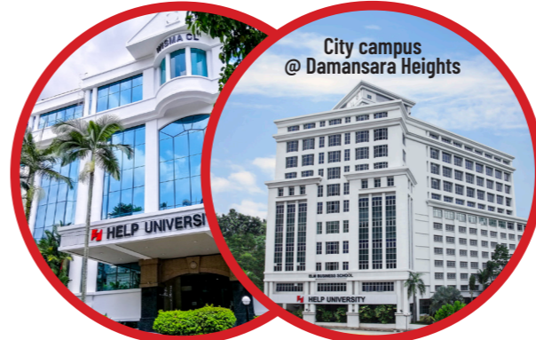
City campus @ Damansara Heights