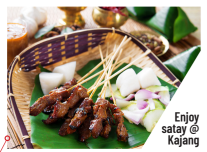
Enjoy satay @ Kajang

Kajang Stadium Kajang Sungai Jernih Bukit Dukung Batu 11 Cheras Bandar Tun Hussein Onn Sri Raya Taman Suntex Taman Connaught Taman Mutiara Taman Midah Taman Pertama