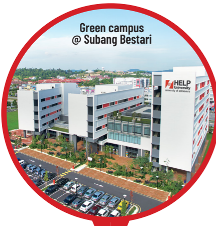
Green campus @ Subang Bestari

Kwasa Damansara Kwasa Sentral Kota Damansara Surian Mutiara Damansara Bandar Utama Taman Tun Dr Ismail Phileo Damansara Pusat Bandar Damansara Semantan Muzium Negara