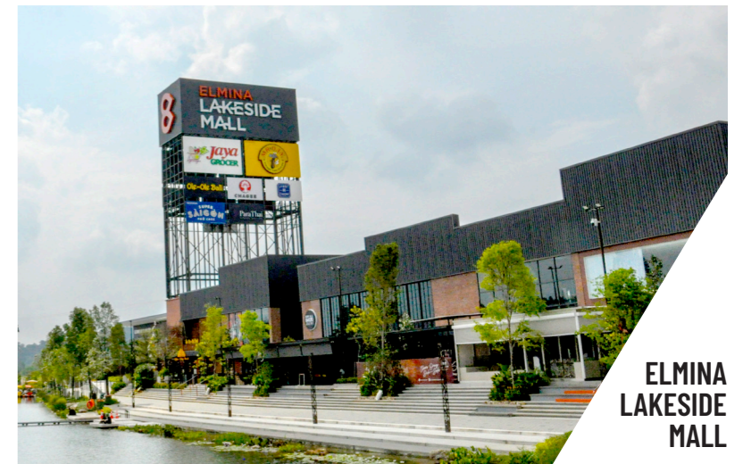
ELMINA LAKESIDE MALL

From trendy restaurants to cosy cafes, there's no shortage of cool hangouts where students can unwind, and hunt for the next Instagrammable foodie hotspot. It's the perfect place to relax, recharge, and have fun with friends!