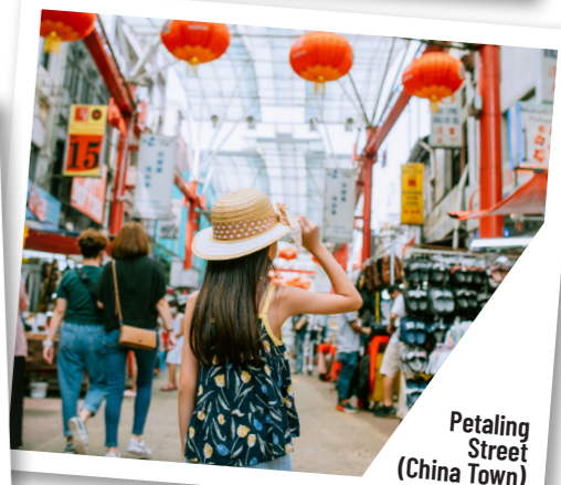
Petaling Street (China Town)