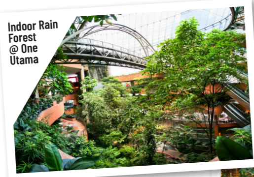
Indoor Rain Forest @ One Utama

Discover captivating sights, indulge in delectable local cuisine, and enjoy leisurely moments in vibrant malls.