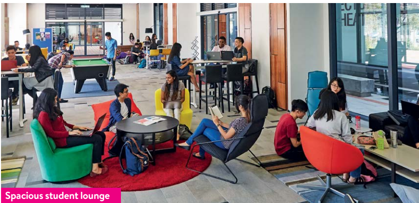
Spacious student lounge