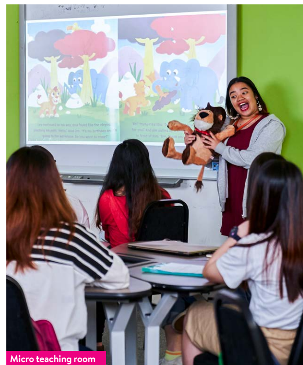
Micro teaching room