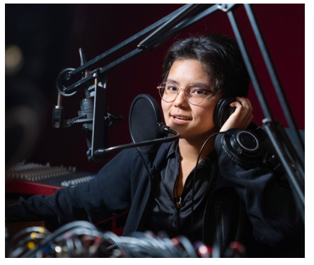
Students have hands on experience with all the equipment available in the faculty.

At the diploma level you also have the chance to follow three pathways: 1) Communication Analytics, 2) Filmmaking, Broadcast and Media, 3) Social and Digital Media Marketing.