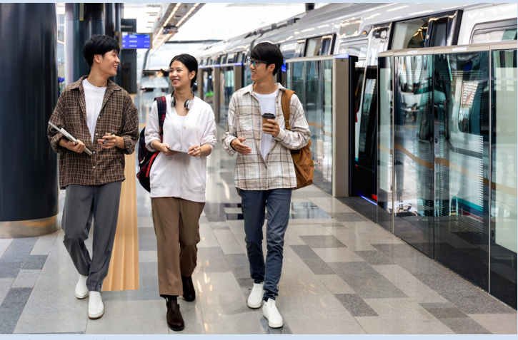
The Semantan MRT station in Damansara Height is just a stone's throw away from Wisma HELP