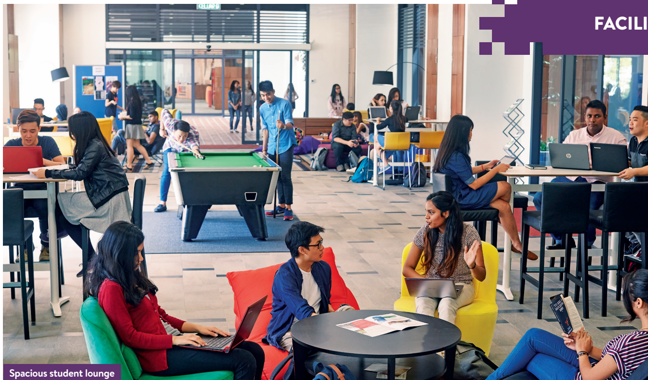
Spacious student lounge