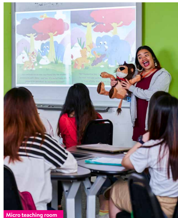
Micro teaching room