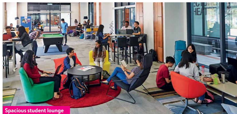
Spacious student lounge