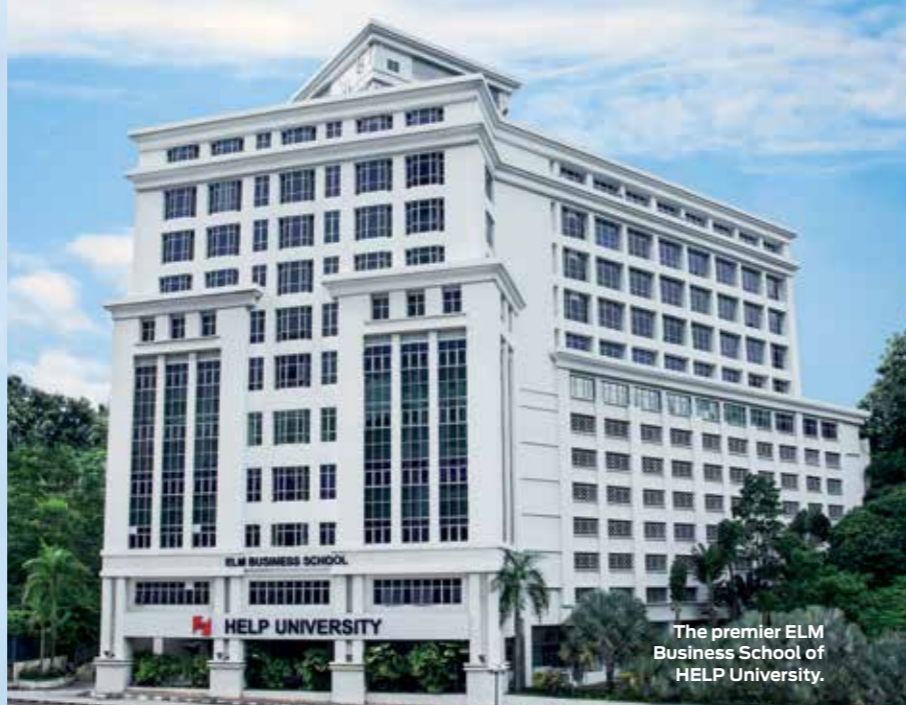
The premier ELM Business School of HELP University.