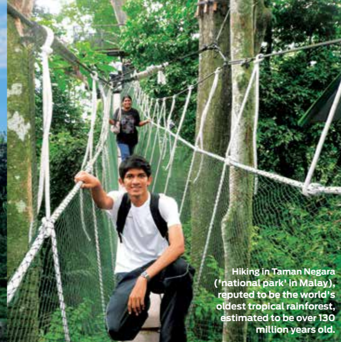
Hiking in Taman Negara ('national park' in Malay), reputed to be the world's oldest tropical rainforest, estimated to be over 130 million years old.

HELP University (HU) is located in Kuala Lumpur, the cosmopolitan and culturally diverse capital city of Malaysia with easy access to top corporations. HU has more than 11,000 students, with a large number of them from 90 countries across the globe. With students from 5 different continents, this university will enrich your cultural experience.