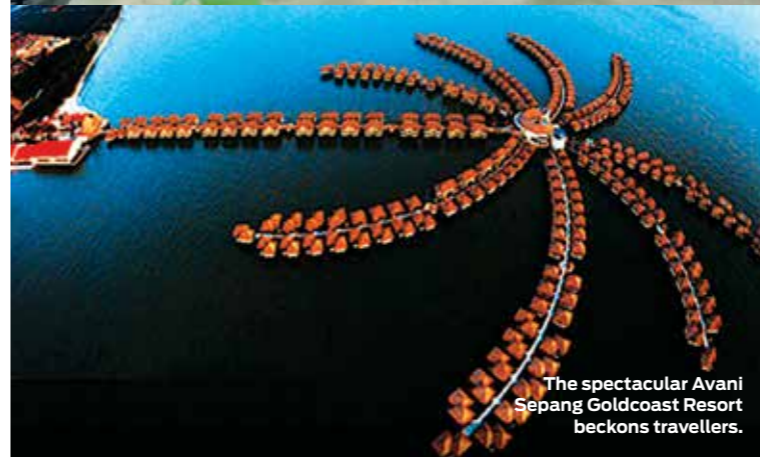
The spectacular Avani Sepang Goldcoast Resort beckons travellers.