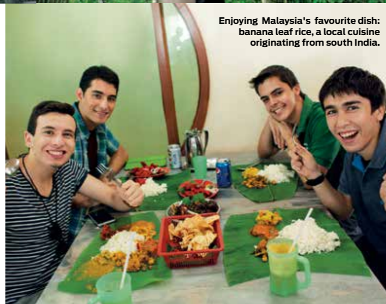
Enjoying Malaysia's favourite dish: banana leaf rice, a local cuisine originating from south India.