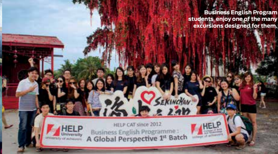
Business English Program students enjoy one of the many excursions designed for them.

International students have a choice of courses that range between one week to four weeks. Upon completion of this course, credits may be awarded to the students' program at the home institution.