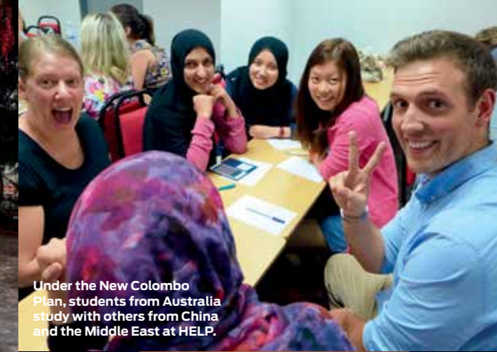
Under the New Colombo Plan, students from Australia study with others from China and the Middle East at HELP.

This program is open to both undergraduate and graduate students enrolled as full time students. It is very important to plan your course sequencing well in advance of your chosen program.