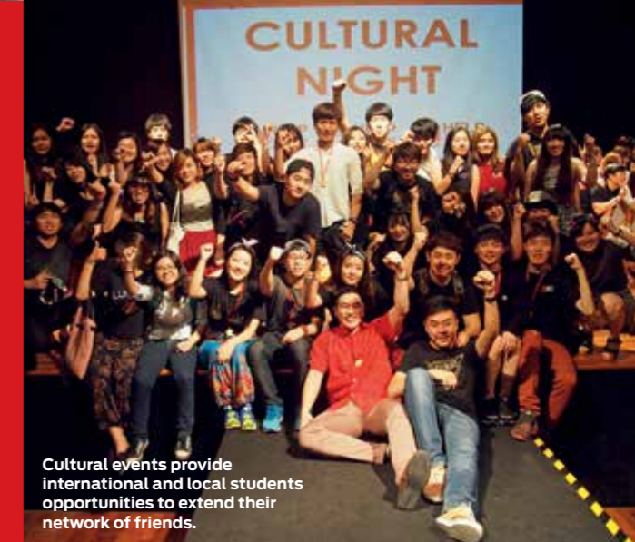
Cultural events provide international and local students opportunities to extend their network of friends.