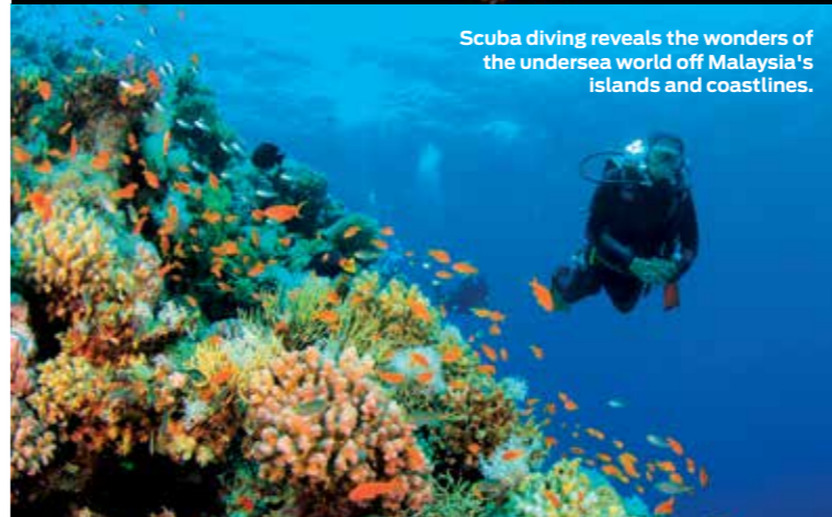
Scuba diving reveals the wonders of the undersea world off Malaysia's islands and coastlines.