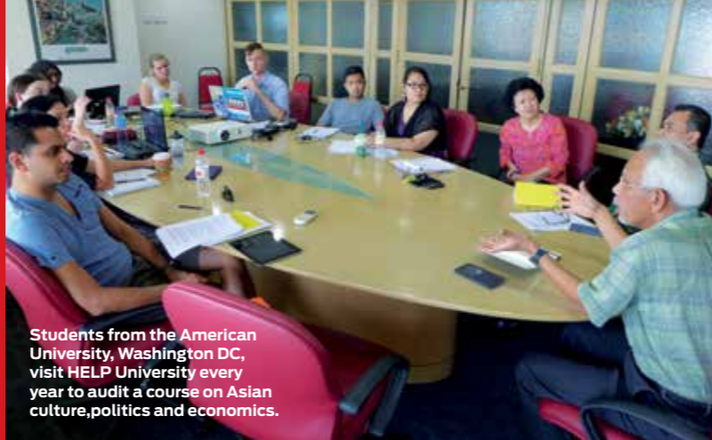
Students from the American University, Washington DC, visit HELP University every year to audit a course on Asian culture, politics and economics.

A unique karst topography of some 2,000 limestone islets jutting out of the sea, often vertical formations covered in dense forest.